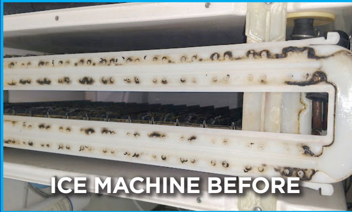
ICE MACHINE BEFORE

Our technology takes cold tap water and infuses it with ozone gas to create our Aqueous Ozone Solution . CleanCore Solution's™ patented technology creates a cleaning solution that contains an effective concentration of dissolved ozone.