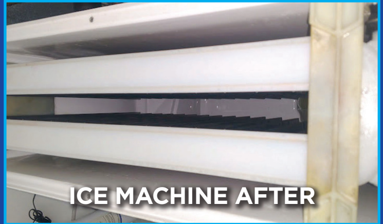
ICE MACHINE AFTER